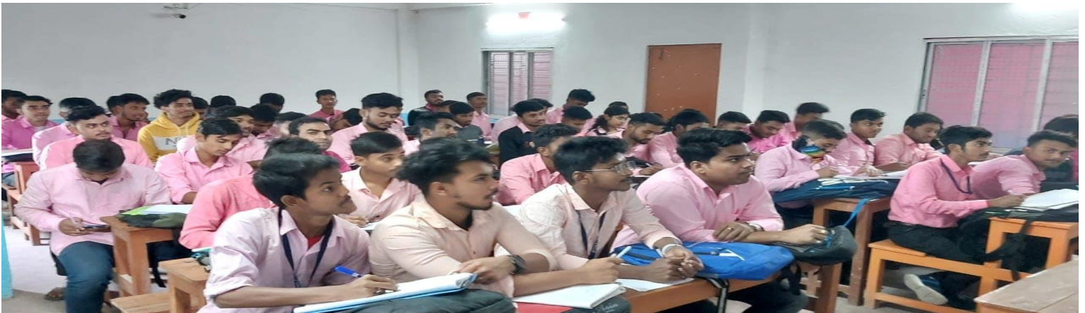
a)( Photo of Class Room)

Bagula Private ITI Institution has 21 class rooms for taking theoretical classes and 16 workshops to explore experimental learning. Each of these rooms is equipped with black as well as white boards, adequate desks and benches. All the class rooms of main building are Wi-Fi enabled. Sometimes classes are conducted in laboratories also due to the insufficient number of class room.