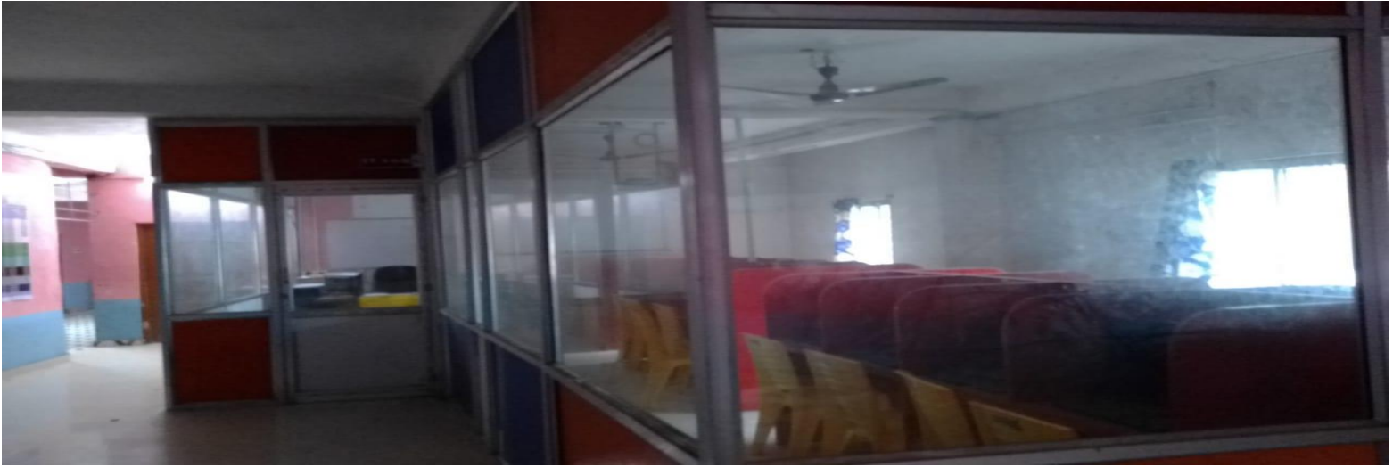
c) Photo of Computer Lab.