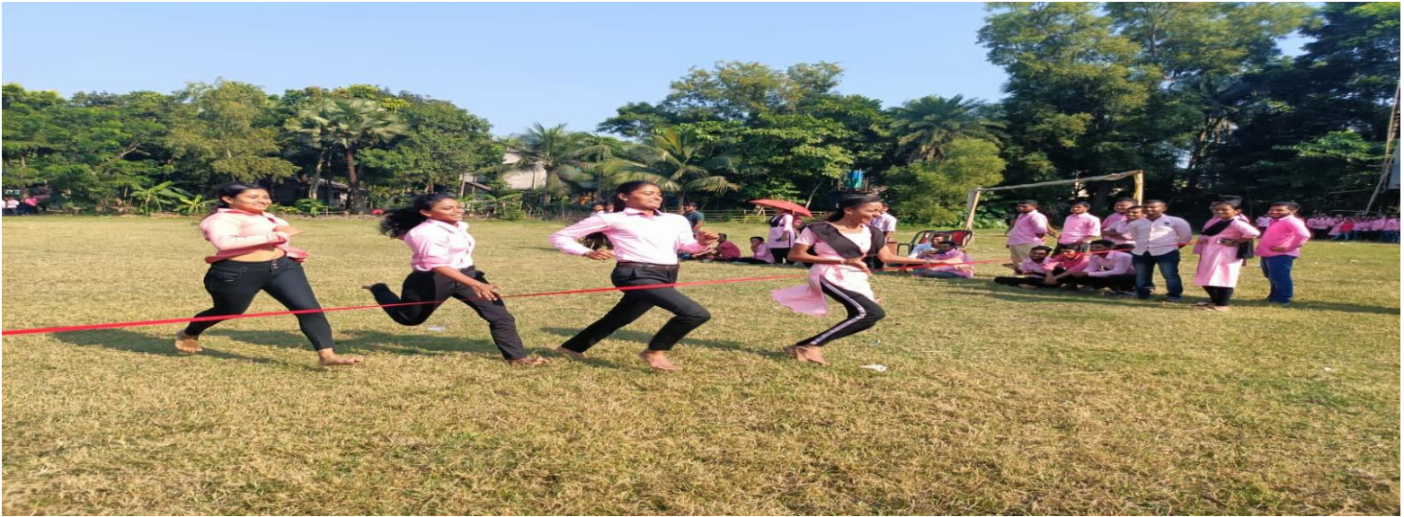
g) Photo of College Playground