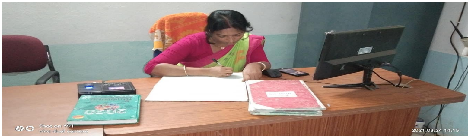
e) Photo of Cash Section Office