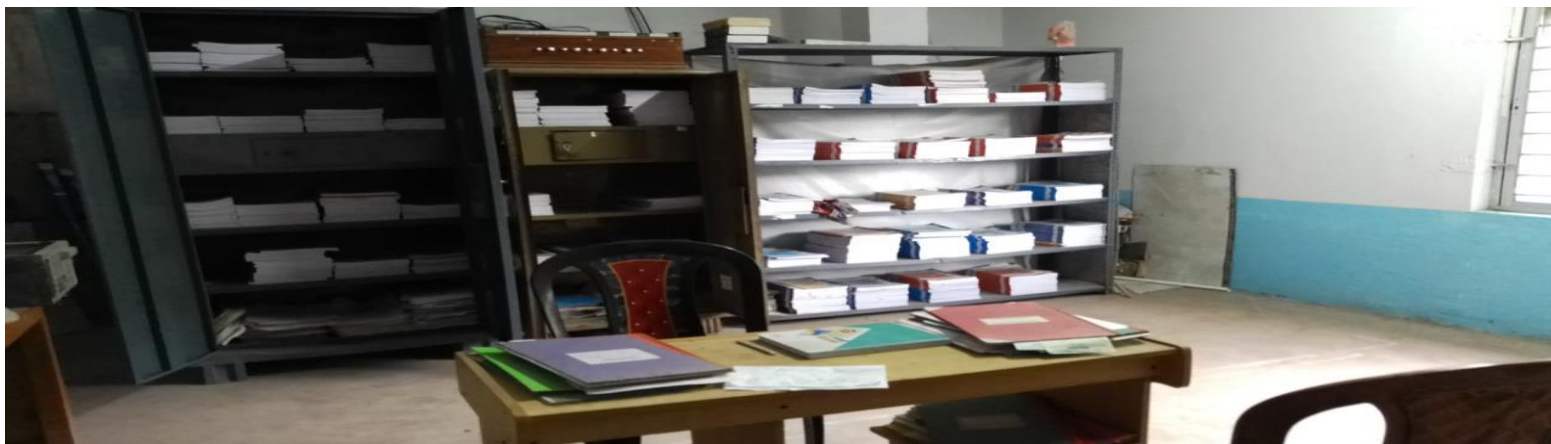
f) Photo of College Library

College Library is located on the 1st floor of the college main building. Total area of the library is about (in Sq. Mts.)- 60 sq. mts. The college central library is air conditioned and Wi-Fi facilities are also there. It has seating capacity about 40 for general students. The library has a rich collection of books on various subjects taught in the college and at present having more than one thousand two hundred books. The Library subscribes magazines, journals and periodicals. Some prominent English and Bengali daily newspapers are also subscribed in the library. Library is open from 10.30a.m. to 4.30 p.m. on all working days. The N-List project enables faculty members to access e-resources.